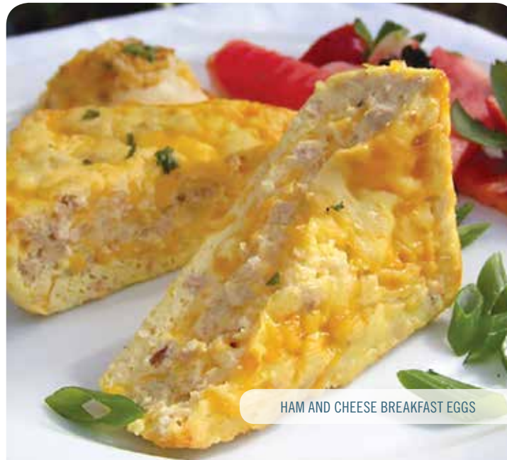
HAM AND CHEESE BREAKFAST EGGS

Thrive Dining is Watermark’s version of the Grind Dining™ program. To quote the originators, “[The program] focuses on independence, dignity and accessibility. This process transforms items from the traditional menu into nutritional, visually pleasing, easily handled portions that retain all the taste, texture and flavors of the same meal. No more prepackaged finger food for residents with cognitive, neuromuscular and chewing disorders.” To learn more or to view a vast array of menu items and photos, visit http://www.grinddining.com .