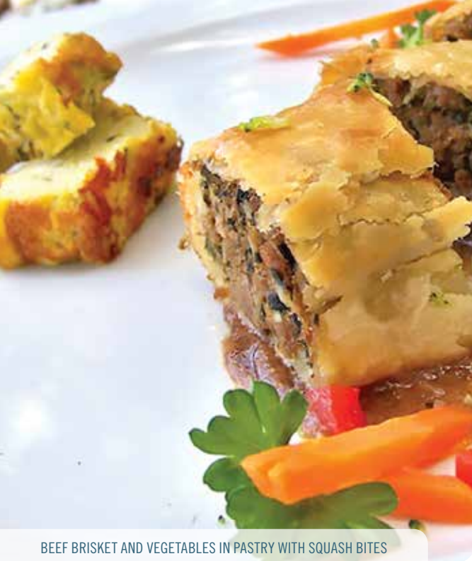
BEEF BRISKET AND VEGETABLES IN PASTRY WITH SQUASH BITES