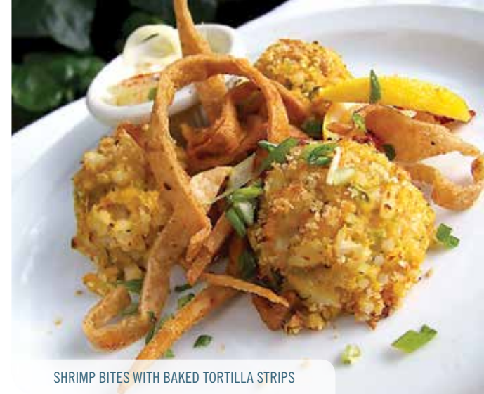
SHRIMP BITES WITH BAKED TORTILLA STRIPS